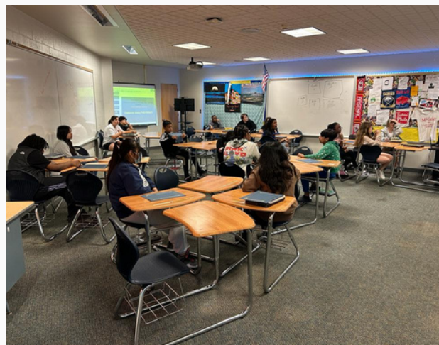
Fig. 5: Students Watching a Video Clip During the YouthBuild DAP Lesson (May 2023).