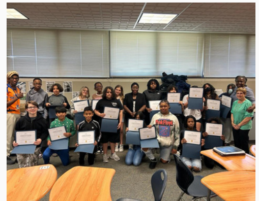
Fig. 2: EAST Norriton Middle School Students with their Certificates of Participation in the YouthBuild Diversity Ambassador Program (June 2023).

The two school districts had to figure out how to accommodate our program, and this took some time during the school year to come up with a plan of action. After some delay, eventually we were able to provide our youth program in the spring of 2023 (April to June) to both school districts and the local after-school youth program.