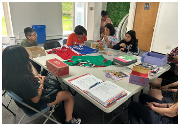
Fig. 1: C-CATE Students Sharing their DIVERSITY Box Project (April 2023).

Through targeted education and skill-building activities in small and large group settings, participants gained the confidence and competence to become advocates for diversity, equity, inclusion, and social justice. Significant progress was made in achieving the desired outcomes throughout the program's inaugural year. Students actively participated in sharing their personal narratives, which not only validated their unique identities, but also encouraged open dialogue and respect for others. The program successfully created an environment that promoted inclusivity, understanding, empathy, and appreciation for diversity.