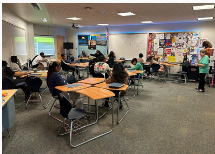
Fig. 3: Students at East Norriton Middle School (NASD) During YouthBuild DAP Lesson (May 2023).

We were scheduled to provide the youth program to the three middle schools in the Norristown Area School District – Eisenhower Middle School, East Norriton Middle School, and Stewart Middle School. Due to scheduling issues at Eisenhower Middle School, we ended up working with sixth-grade students at East Norriton Middle School and seventh-grade students at Stewart Middle School instead. At North Penn School District, we were initially scheduled to provide the program during the school day. The school district administration later changed that arrangement to after-school hours. Consequently, this last-minute change affected the number of sixth grade students enrolled in the program at Inglewood Elementary and Gwyn-Nor Elementary Schools. At the local Community Youth program (C-CATE), we had students in 6th to 11th grades who participated in the YouthBuild Diversity Ambassador Program. We provided our youth program to eighty-five students across the five cohorts.